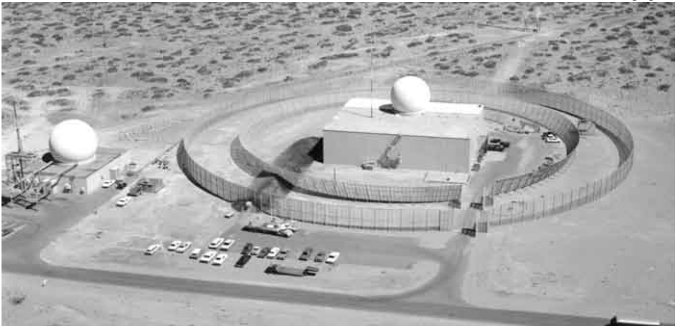
This photo shows the Target Tracking Radar (TTR) on the left and the Discrimination Radar (DR) at right.