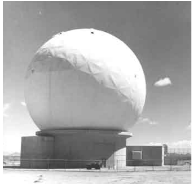
ZAR Receiver Dome with Receiver Building Behind and Transmitter in background.

So, that is a very brief look at LC-38 and the Zeus radar systems as they were during the Zeus system tests at White Sands. The next issue will deal with life at LC-38 after Zeus in our look at the way it was Way Back When!