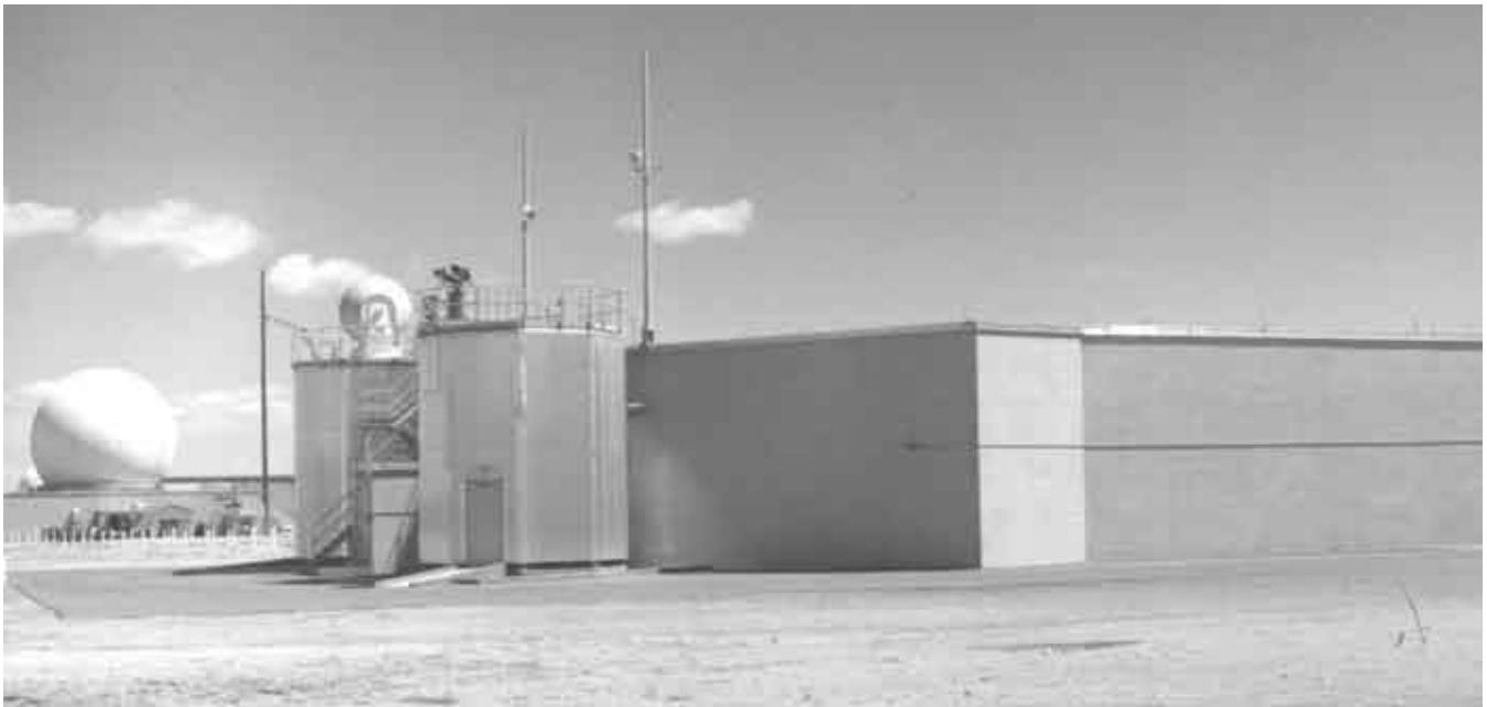
Battery Control Building with the Missile Tracking Radar on the tower at left and the Target Tracking Radar dome beyond at left.