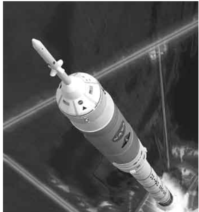
An artist concept of an Ares launch with the Orion crew capsule and the abort system in the tower on top.

Although the luncheon and briefings are sponsored by the Pioneer Group and the Historical Foundation, it is open to anyone wishing to attend.