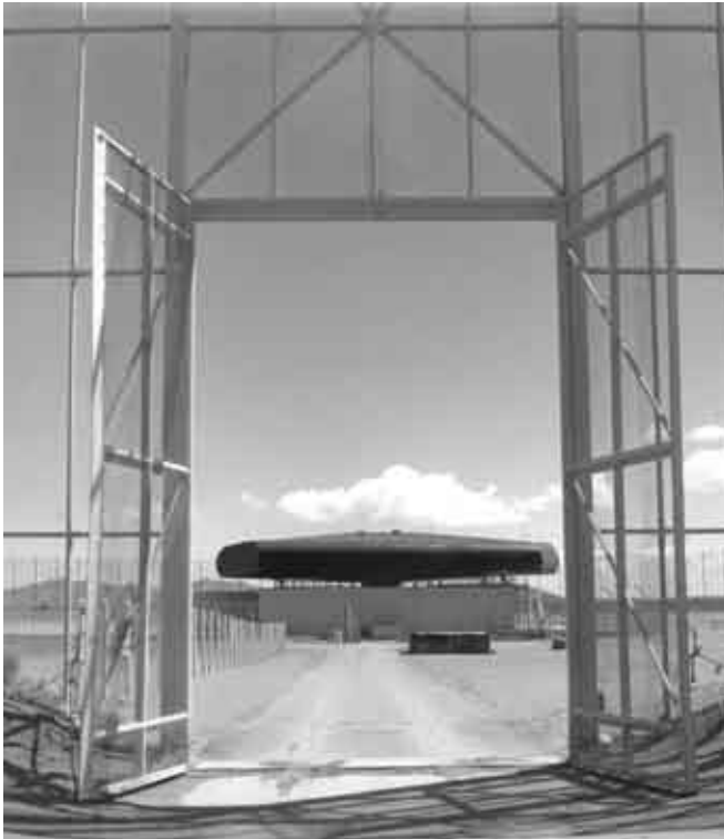
ZAR transmitter building with triangular antenna on top inside the clutter fence.

proceeds toward its intended target. There isn't just the re-entry vehicle (RV) or warhead coming in. There could also be multiple RVs as well. There are a lot of other things tagging along too. There will be expended stages, various parts that have been ejected or blown away as the stages separate and/or the RV is extracted from the main missile. There can also be decoys - objects made to resemble the actual RV to confuse the radars. This grouping of things are what is called a "cloud" and represents a problem for radars to sort out what is junk and what is the actual RV(s). Thus, the function of the Discrimination Radar was to take care of this task. The DR was sort of a cross between normal tracking radars, similar to the TTR, and features similar to that of array radars. By using multiple feedhorns and off-axis tracking techniques, it was able to watch and analyze all the objects in the cloud and based upon several factors, more accurately identify the actual RV.