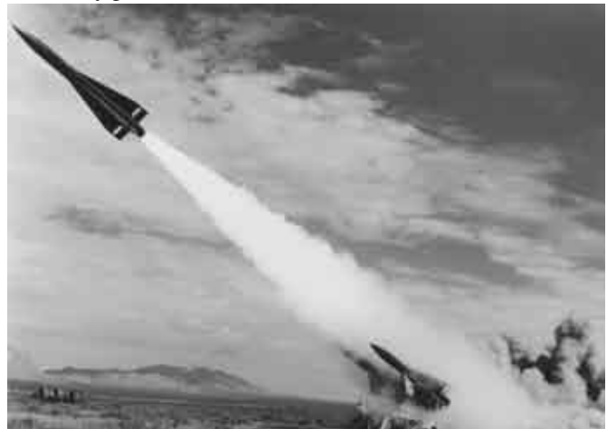
A HAWK missile test at White Sands.

It worked the way we hoped it would, and the missile flight test came off as planned. We were able to do all our subsequent missile tests against low altitude ECM targets without the use of aircraft or helicopter drones. I believe other missile systems used the same kind of installation when they performed similar tests after that.